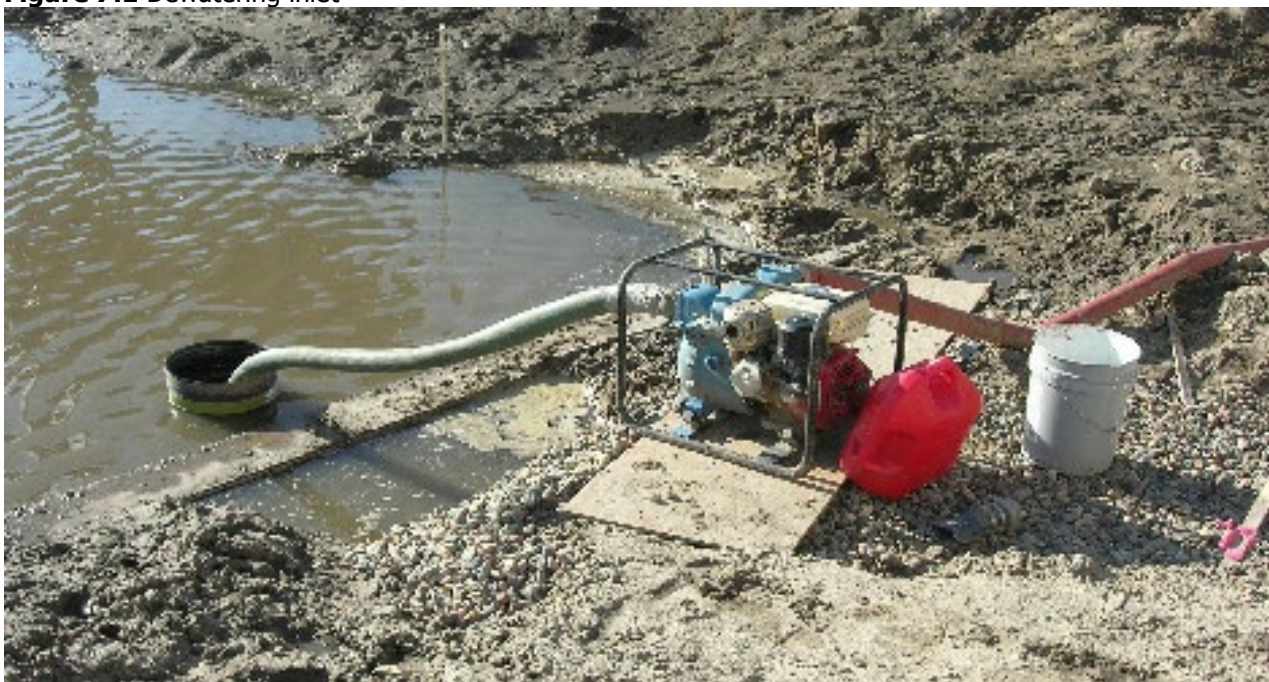
Figure 7.1 Dewatering inlet