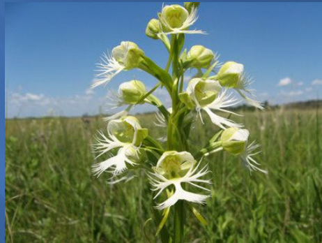
Western Prairie-Fringed Orchid