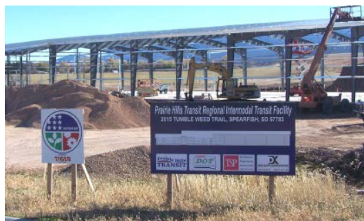
In 2009-2010, SDDOT awarded $7.4 million to buy buses and build transit facilities, sustaining jobs in automotive and construction industries.

Creates jobs – Every 10 jobs in the public transit sector create 3 additional jobs in supporting industries. Public transit operating and capital expenses, along with spending of out-of-pocket cost savings by transit riders, sustained 530 jobs in South Dakota.